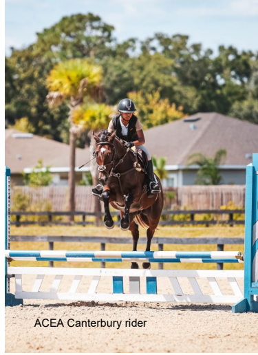
ACEA Canterbury rider

ACEA/Canterbury riders...please submit your year end award photos in .jpg or .pdf format to wittyshowsec@earthlink.net. Some photos from the show didn't save well from texts sent that Sunday.