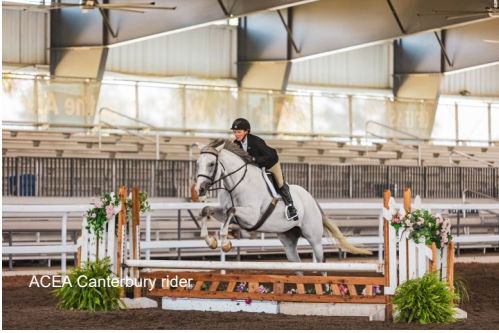
ACEA Canterbury rider

ACEA/Canterbury riders...please submit your year end award photos in .jpg or .pdf format to wittyshowsec@earthlink.net. Some photos from the show didn't save well from texts sent that Sunday.