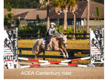
ACEA Canterbury rider