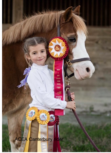
ACEA Canterbury rider

ACEA/Canterbury riders...please submit your year end award photos in .jpg or .pdf format to wittyshowsec@earthlink.net. Some photos from the show didn't save well from texts sent that Sunday.