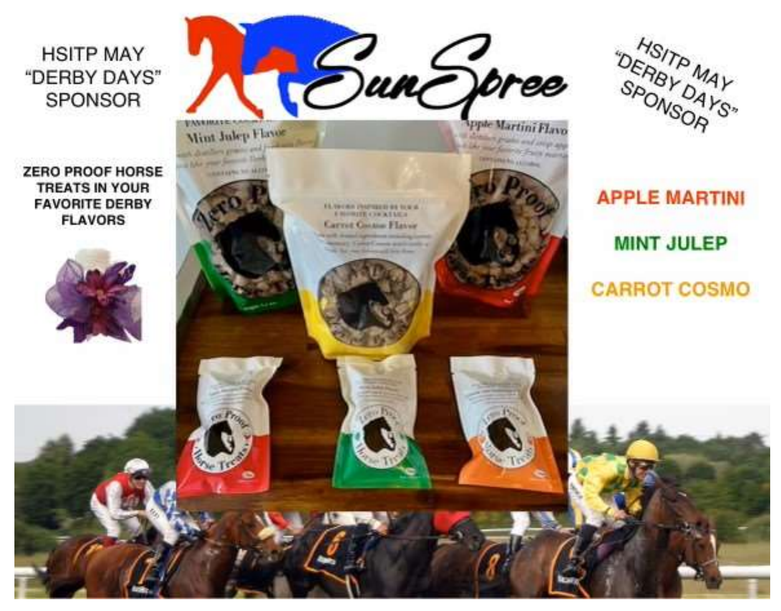
SUNSPREE MOBILE TACK

ANNOUNCES THEIR "DERBY DAYS" SHOW HSITP SPONSORSHIP OF MEDAL AND CLASSIC WINNERS