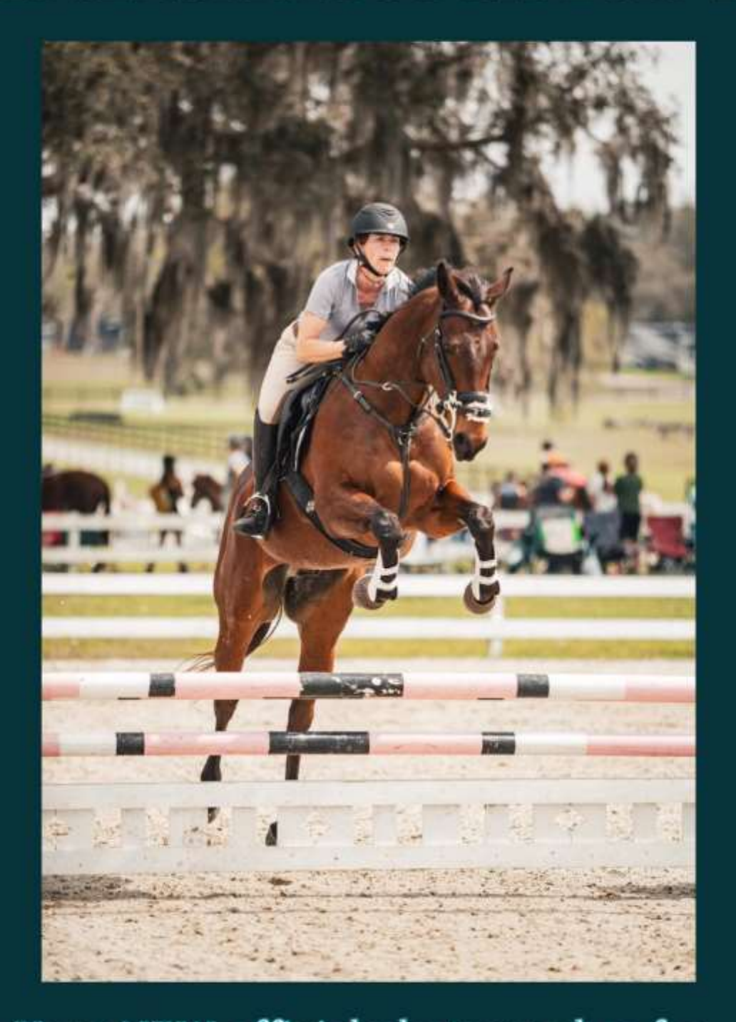
Your NEW official photographer for Horse Shows in the Park, LLC